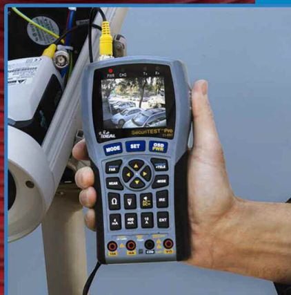
Voice Data Video Tester Category Winner: SecuriTEST™ Pro