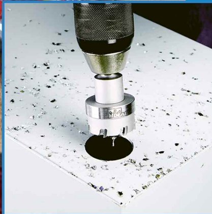
Handtool Accessories Category Winner: TKO™ Hole Cutters